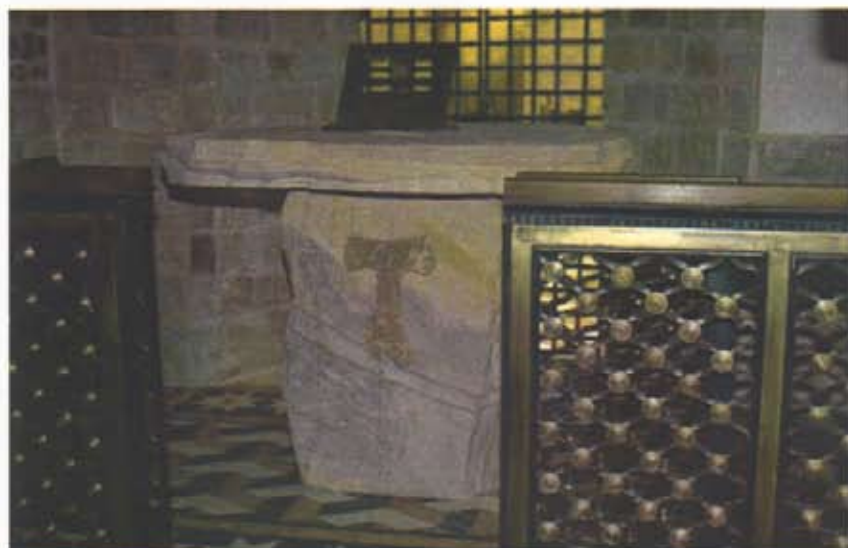
Tao symbol important to many faiths